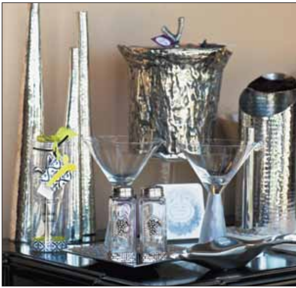
Simple but elegant wedding reception accessories are available at Flair for Gift and Home at Progress Ridge.