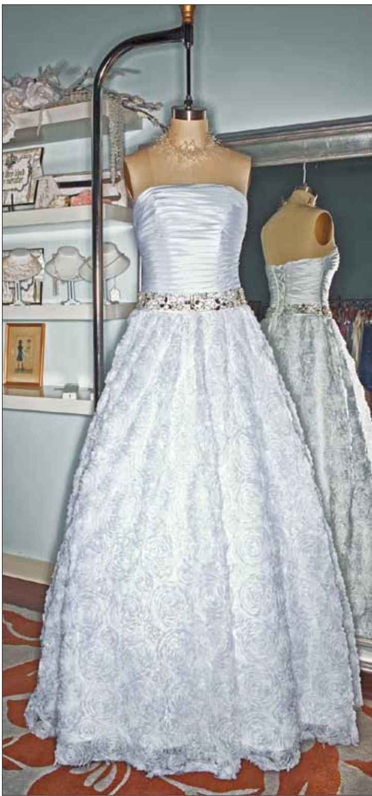
Silkwood at Progress Ridge offers custom-made wedding dresses and accessories by O'Peal Art.

Here's a quick list of some of the many services available close to home by your Progress Ridge merchants: