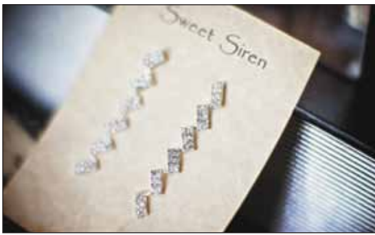
Wedding accessories such as earrings are available at Sweet Siren at Progress Ridge.