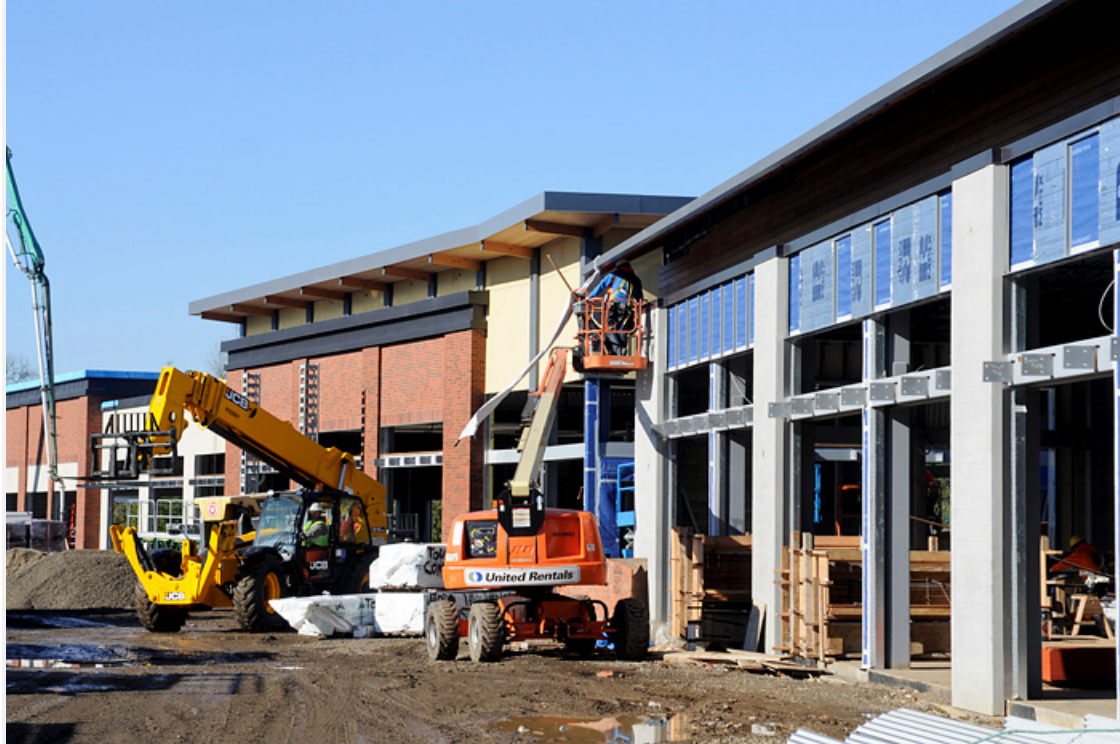
Kruse Village's six structures are being built with different cladding materials to give each one a unique identity.