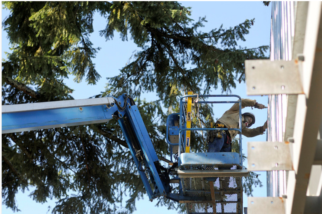
Mike Reich, a carpenter with Cascade Acoustics and member of Local 146, installs steel stud framing on a building at Kruse Village.