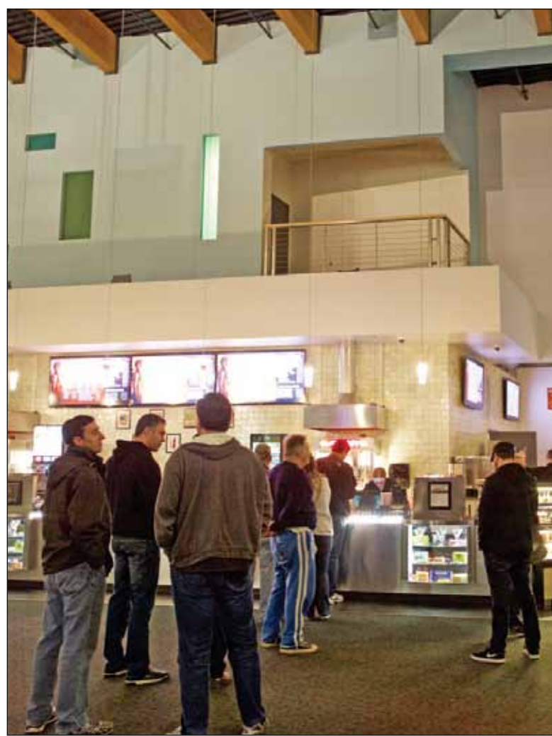
Movie-goers line-up to get treats at the concession stand before their movie starts at Cinetopia.

Give Cinetopia a call at 503-597-6900 Visit them on the web at cinetopia.com