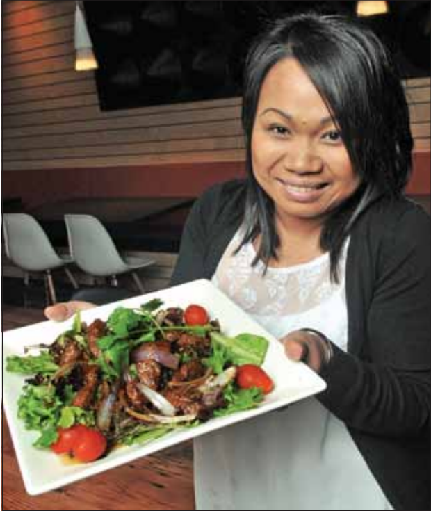
4 La Sen - Discover a new kind of Asian food in West Linn.