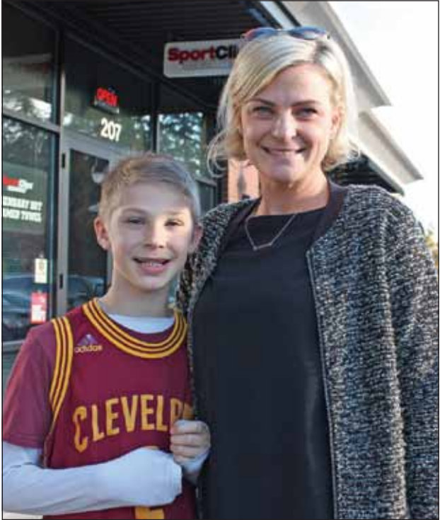
3 Giving Thanks. Learn what community members are thankful for.

A SPECIAL PUBLICATION OF PAMPLIN MEDIA GROUP/COMMUNITY NEWSPAPERS