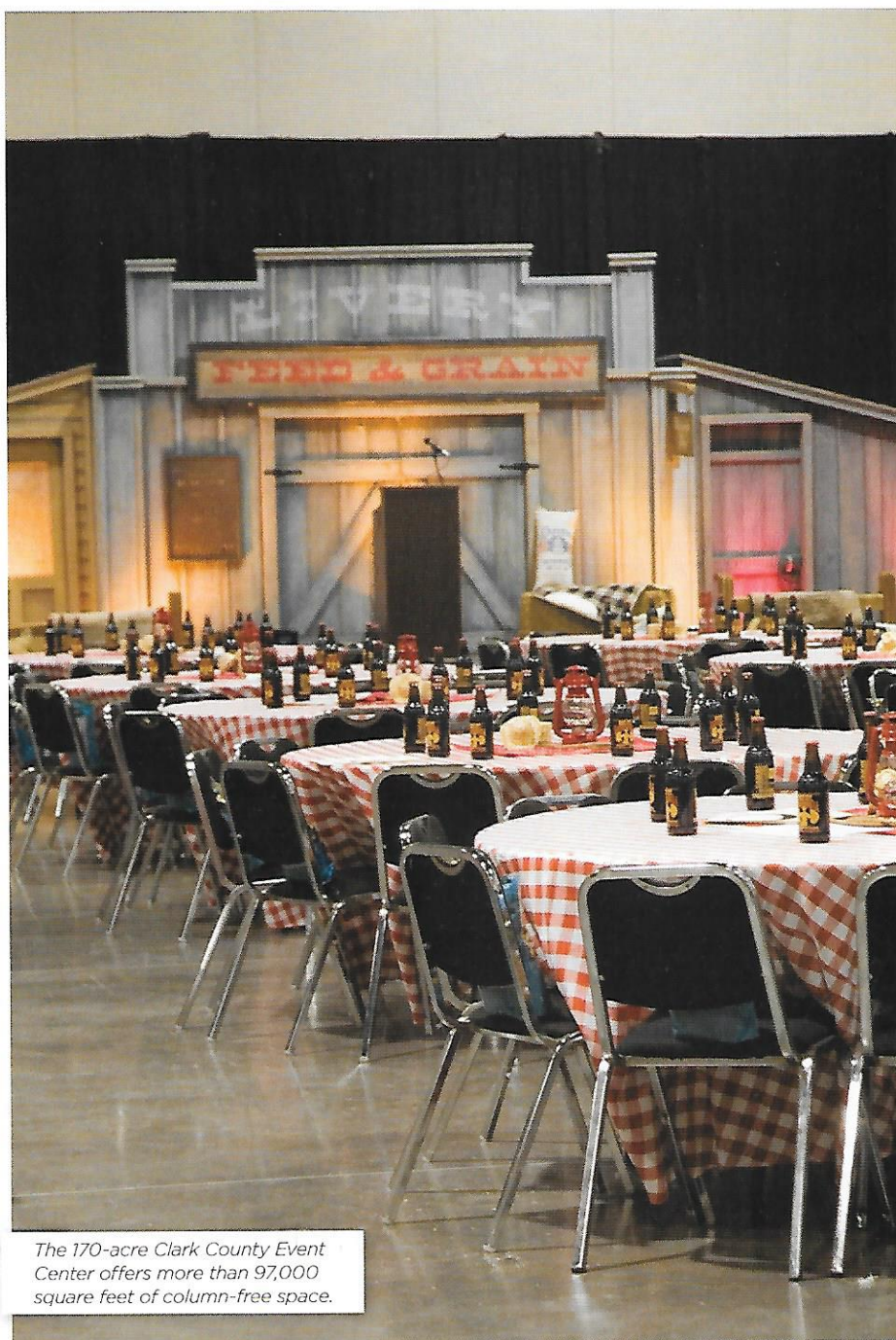
The 170-acre Clark County Event Center offers more than 97,000 square feet of column-free space.

Space and flexibility are the watchwords of the Clark County Event Center . Located in Ridgefield, 10 miles north of downtown Vancouver, the 170-acre event center campus