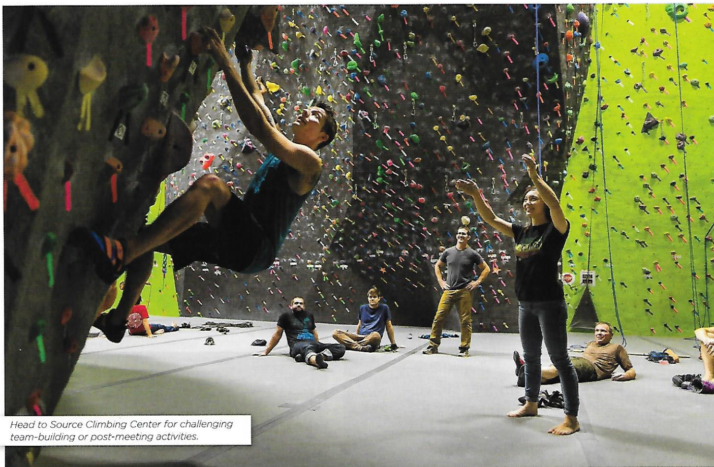
Head to Source Climbing Center for challenging team-building or post-meeting activities.