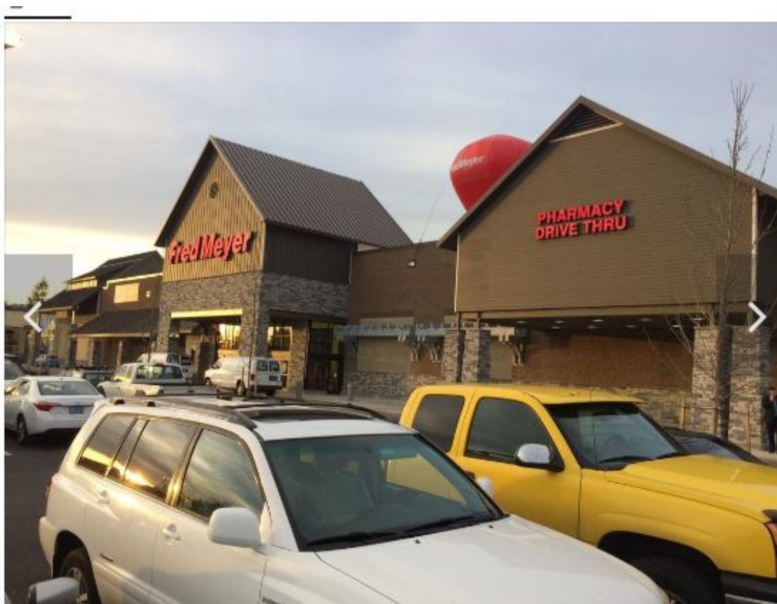
DIANNE DANOWSKI SMITH

The 143,000-square-foot store, Fred Meyer's 133rd, is part of the Happy Valley Crossroads development at Southeast 172nd Avenue and Sunnyside Road.