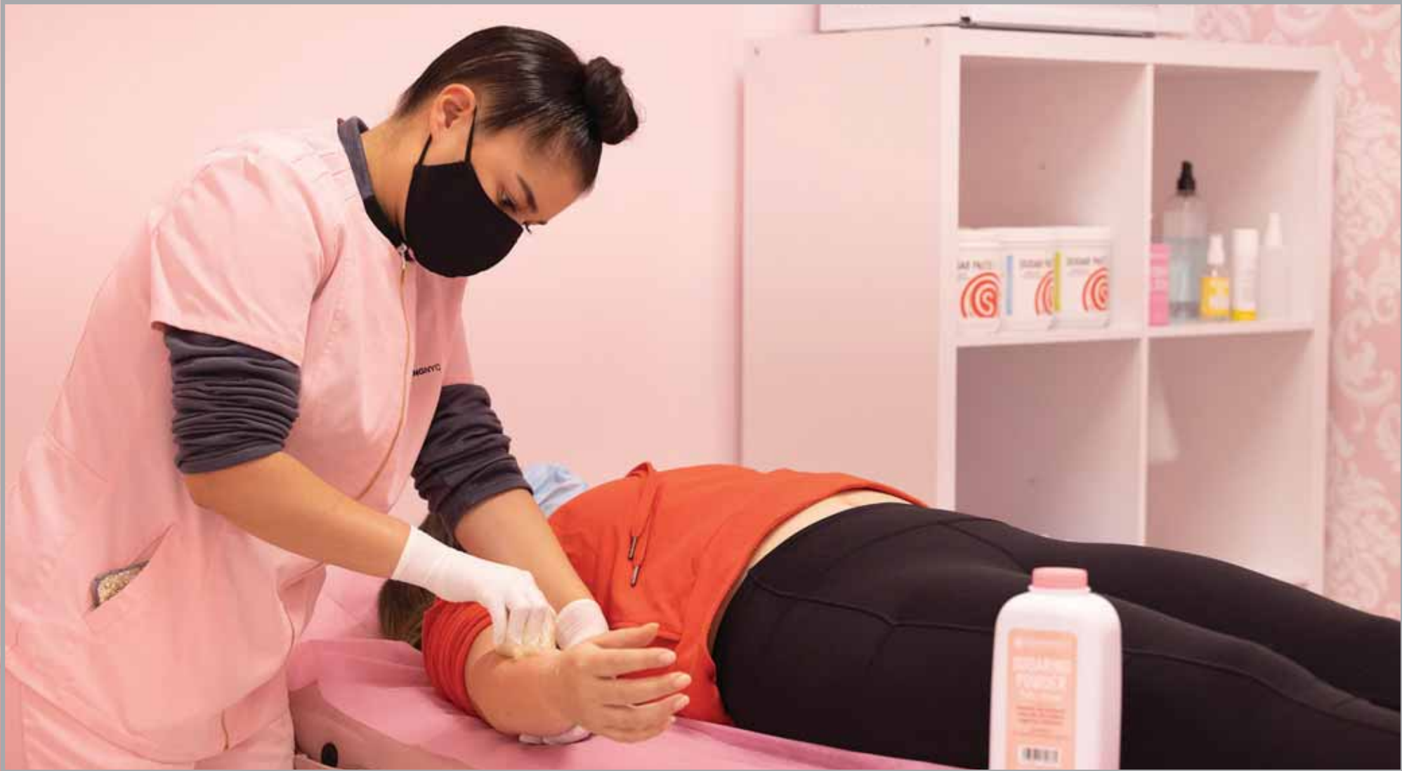
Sugaring NYC uses the less-painful sugaring process to remove hair.