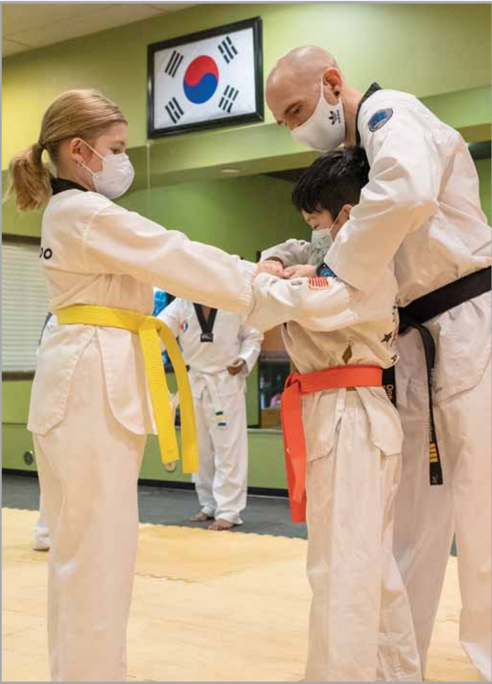
Self-defense training is a key part of taekwondo.

The academy tries to provide useful training for its students