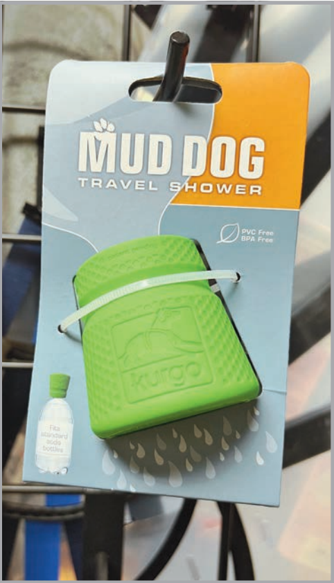
Mud Dog's travel shower head allows you to rinse your dog off while on the go.

For more information visit www.naturespetmarket.com