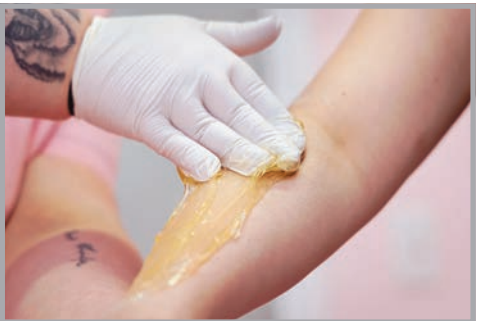
Sugaring is said to be less painful than other forms of hair removal.