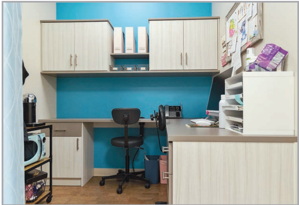
California Closets created an organized office space at You & Eye.

For more information, visit www.californiaclosets.com .