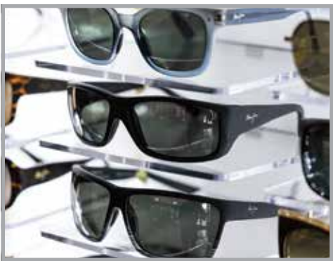
You & Eye now offers sunglasses from Maui Jim, a brand rapidly growing in popularity.