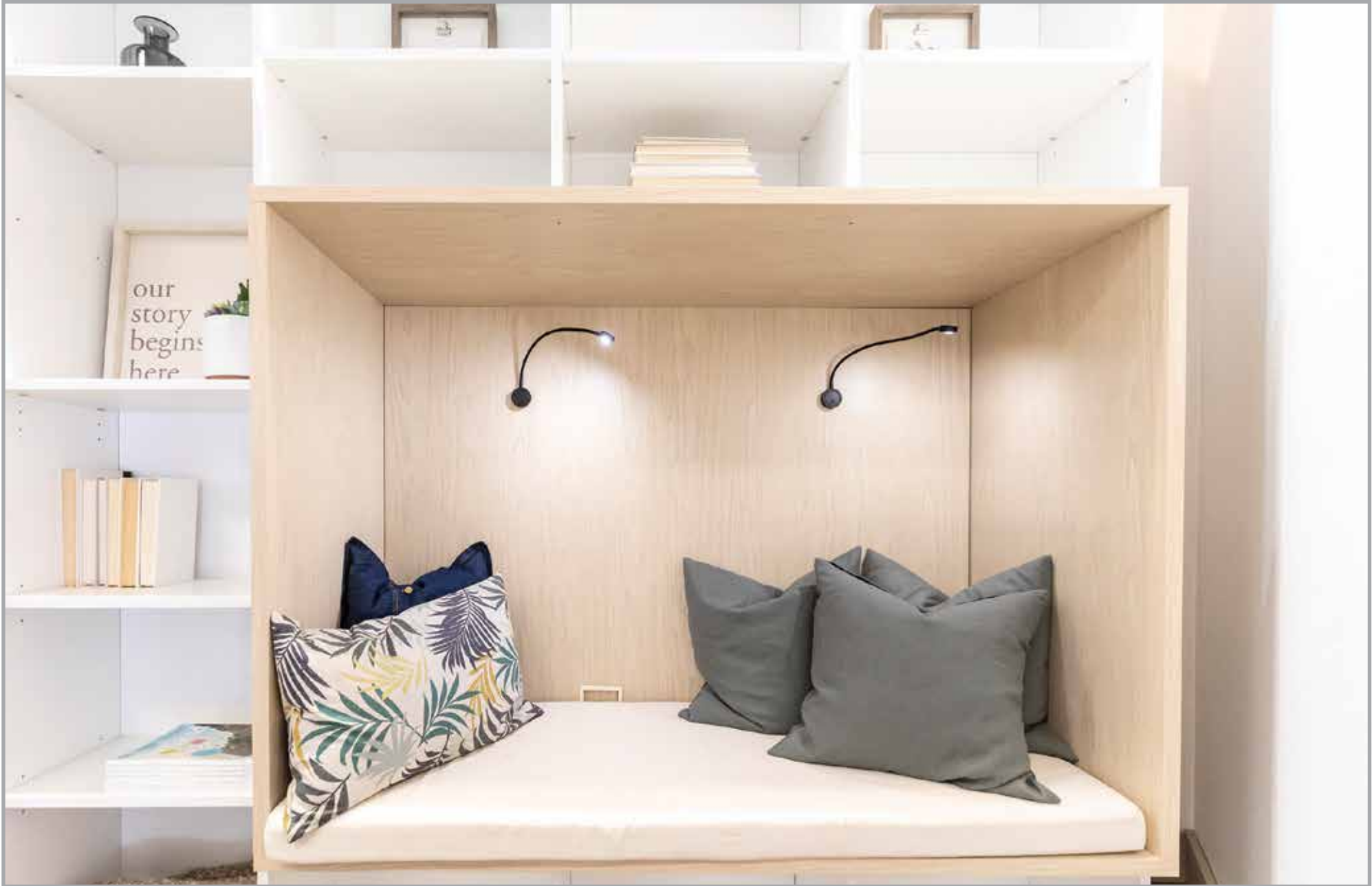
California Closets builds custom-made reading nooks for customers.