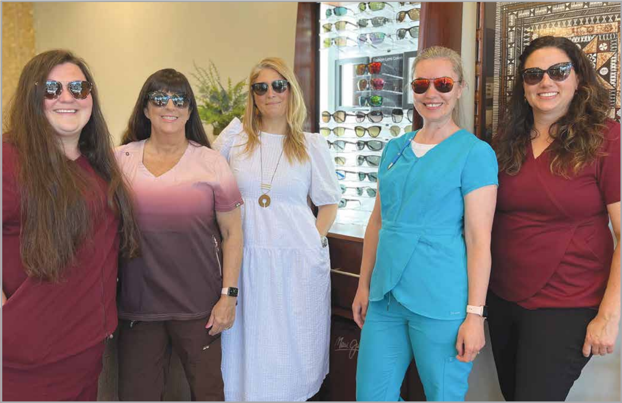
The team at You & Eye Vision Care and Optical Boutique is dedicated to patient-centered care for people of all ages with any vision or eye problem.