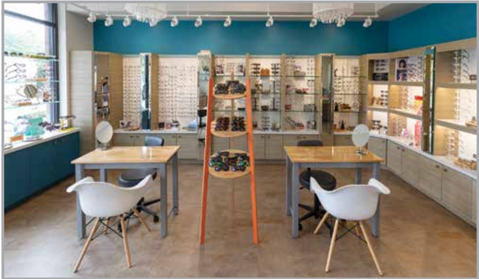
You & Eye has dozens of eyewear brands and styles for you to choose from.