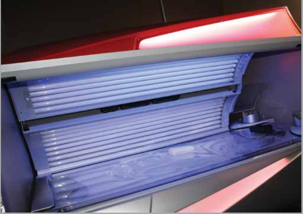
The platinum bed is a middle-ground between the lower- and higher-level gold and diamond options.