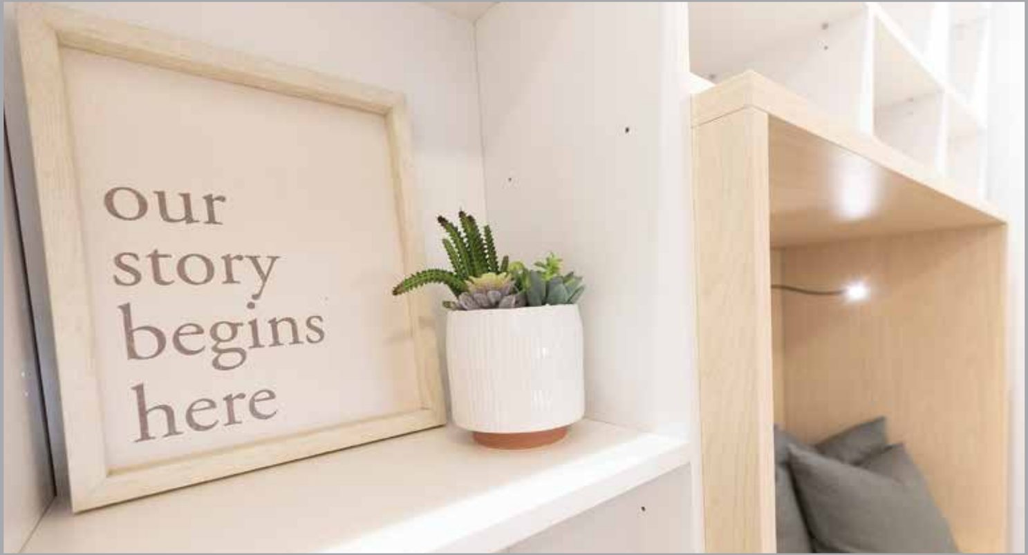
The company creates designs and product sizes that are tailored to the specifications of a customer's home.

Aside from nooks, California Closets can customize closets, garages, work spaces, entertainment centers, kitchen pantries, wine storage spaces, playrooms and more. Along with customers feeling happier with their home following installation, Salvo also noted that revamping spaces can benefit resale value. For more information on California Closets, visit www.californiaclosets.com .