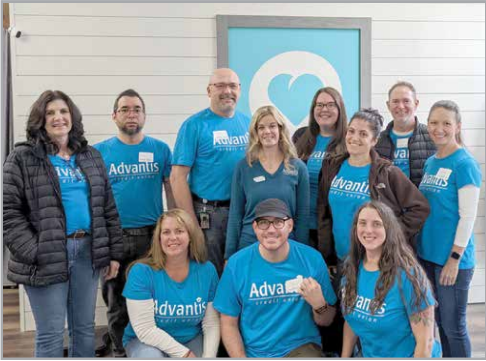
Advantis does monthly volunteer activities with the local nonprofit organization With Love.