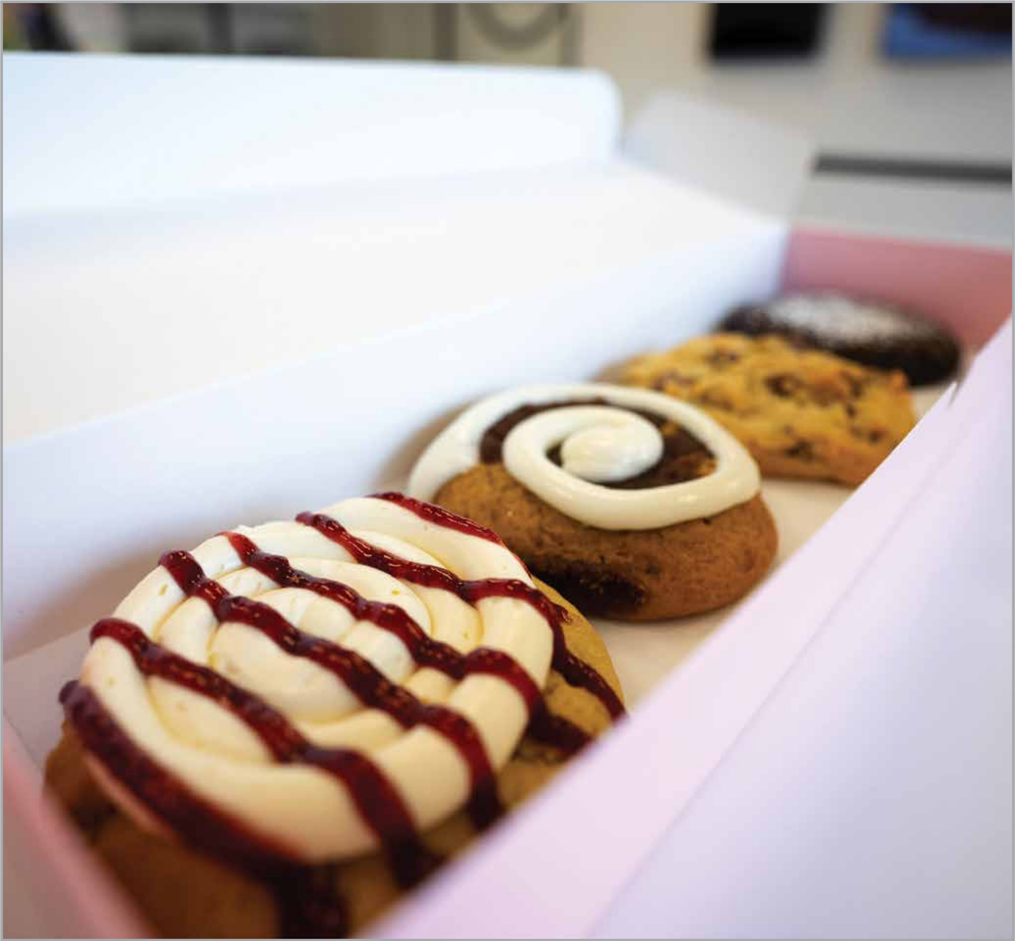
Crumbl Cookies plans to open next to Sports Clips in West Linn Central Village in February.