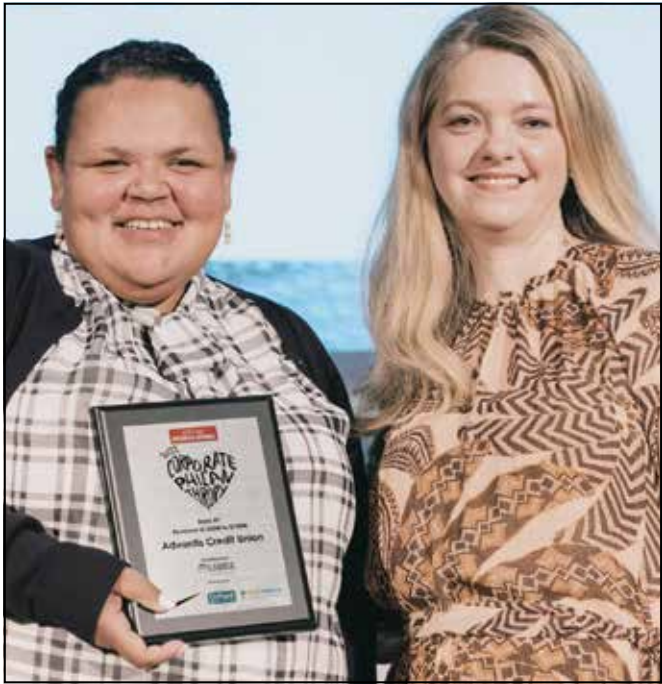
4 ADVANTIS CREDIT UNION The credit union improves user experience, gives back

A SPECIAL PUBLICATION OF PAMPLIN MEDIA GROUP/COMMUNITY NEWSPAPERS