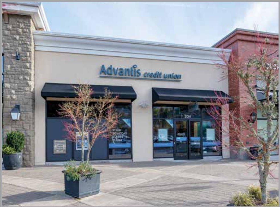
Advantis Credit Union is located in West Linn Central Village.