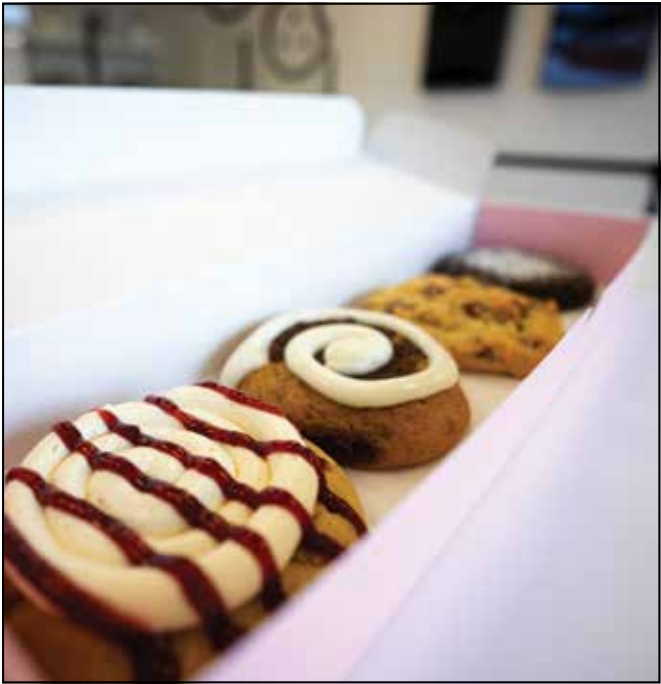
6 CRUMBL COOKIES Cookie shop to open in the Village in 2023