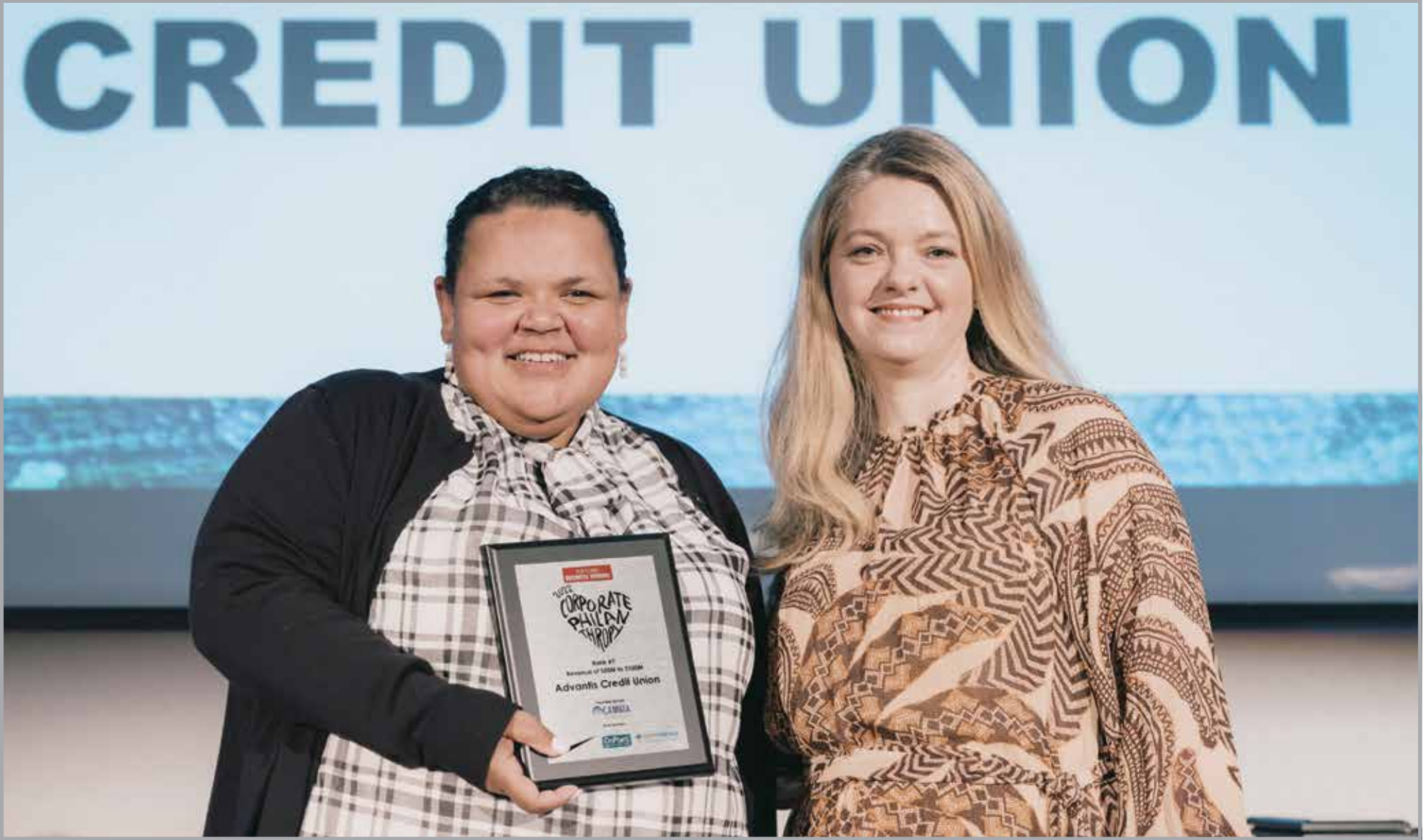
Advantis Credit Union was recently named one of the top 10 corporate philanthropists in Oregon by the Portland Business Journal for the 12th year in a row.