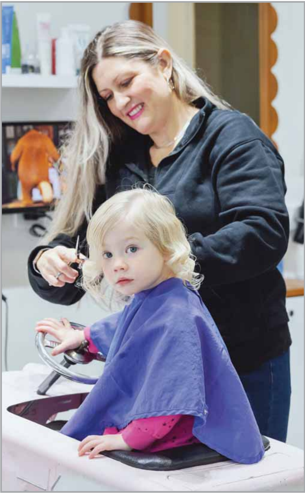
Kids get their hair cut in vehicle-like seats at Sage Kids Salon.