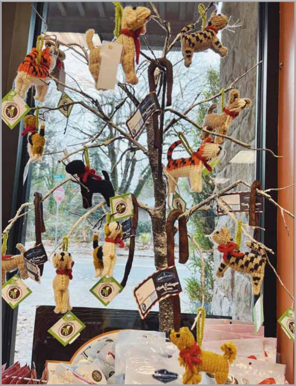
Nature’s Pet in the West Linn Central Village sells hand-knit cat and dog ornaments and collagen beef chew shaped like candy canes.