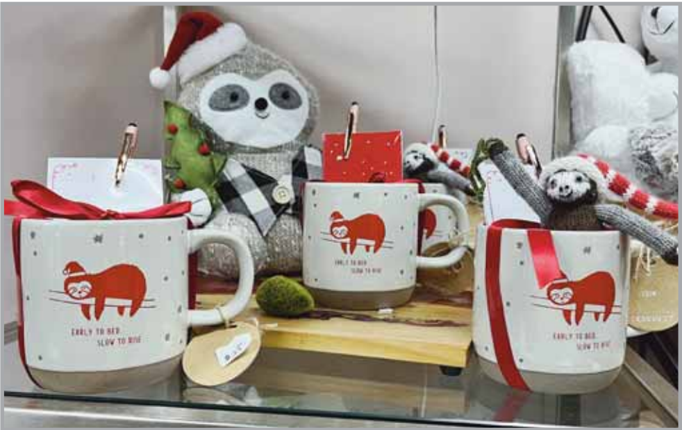
In addition to beautiful bouquets and flower arrangements, Wishing Well offers neat gifts like mugs, candles and more.