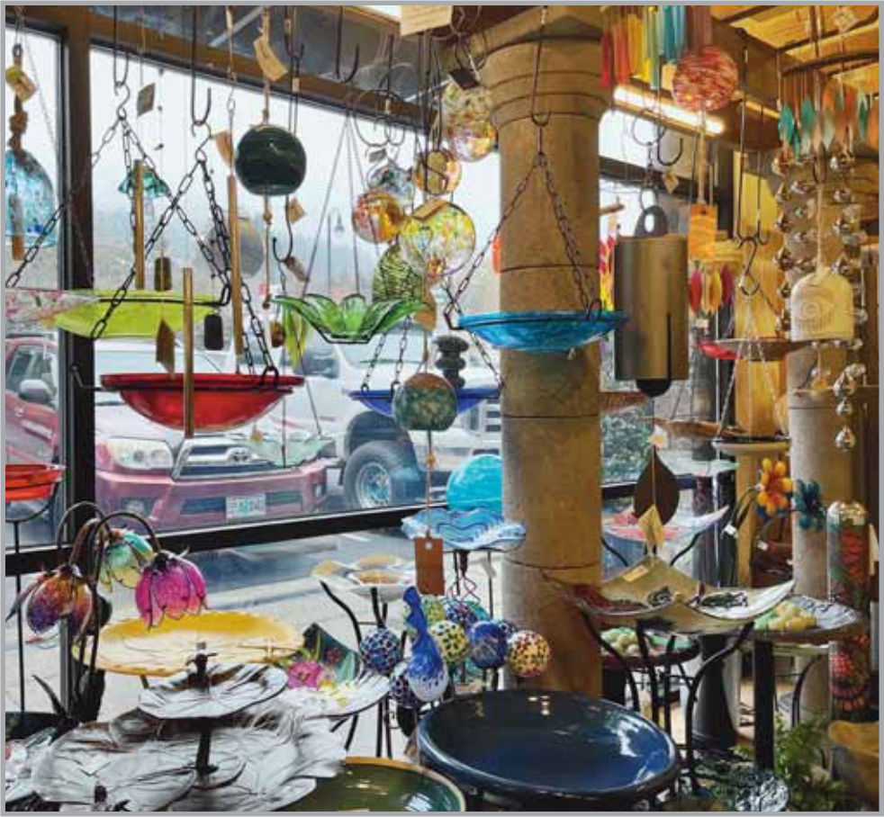
Backyard Bird Shop in the Central Village has a wide selection of unique yard décor like bird baths, wind chimes and bird houses.