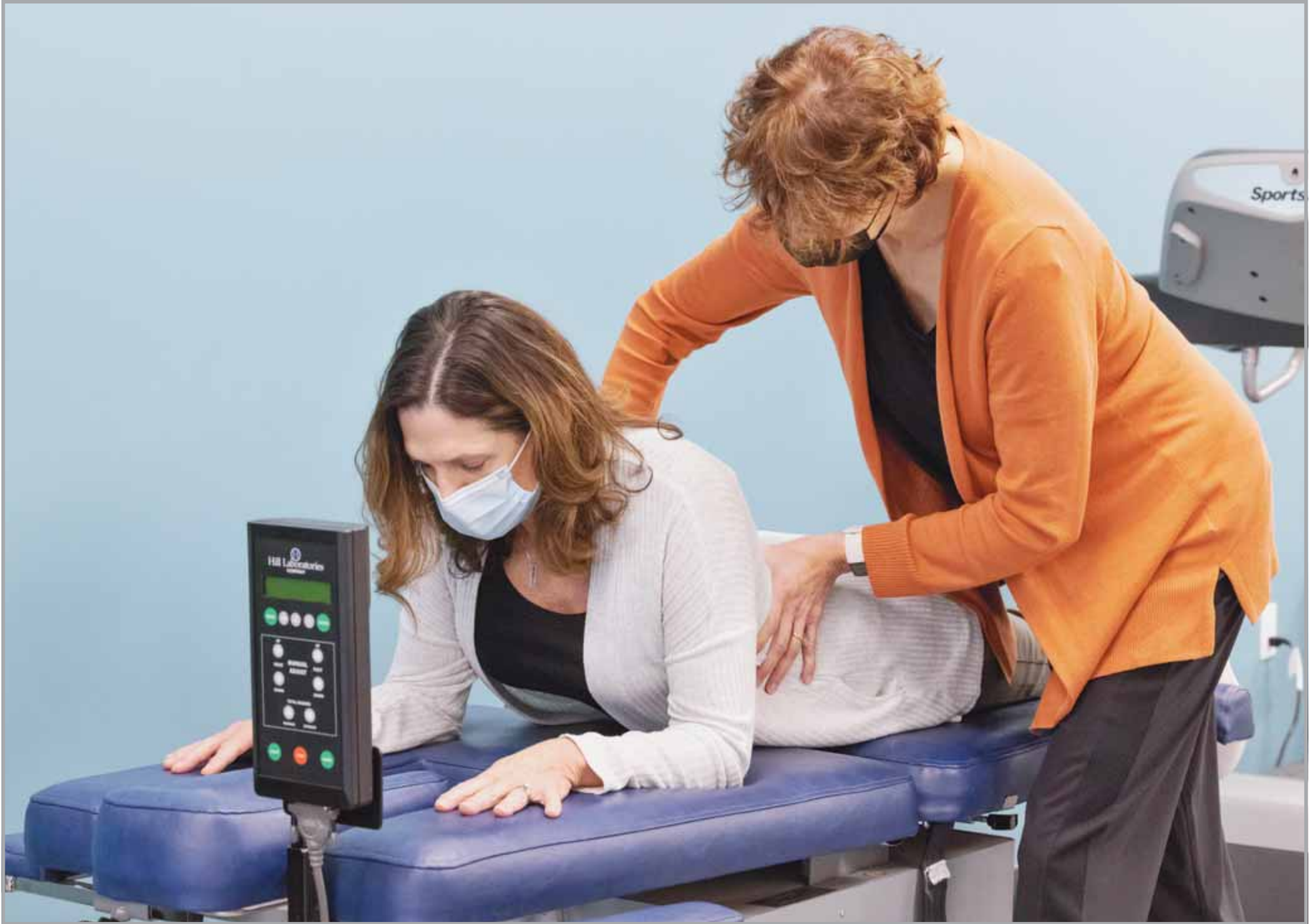
The physical therapists demonstrate a spinal component assessment for bladder problems and pelvic pain.