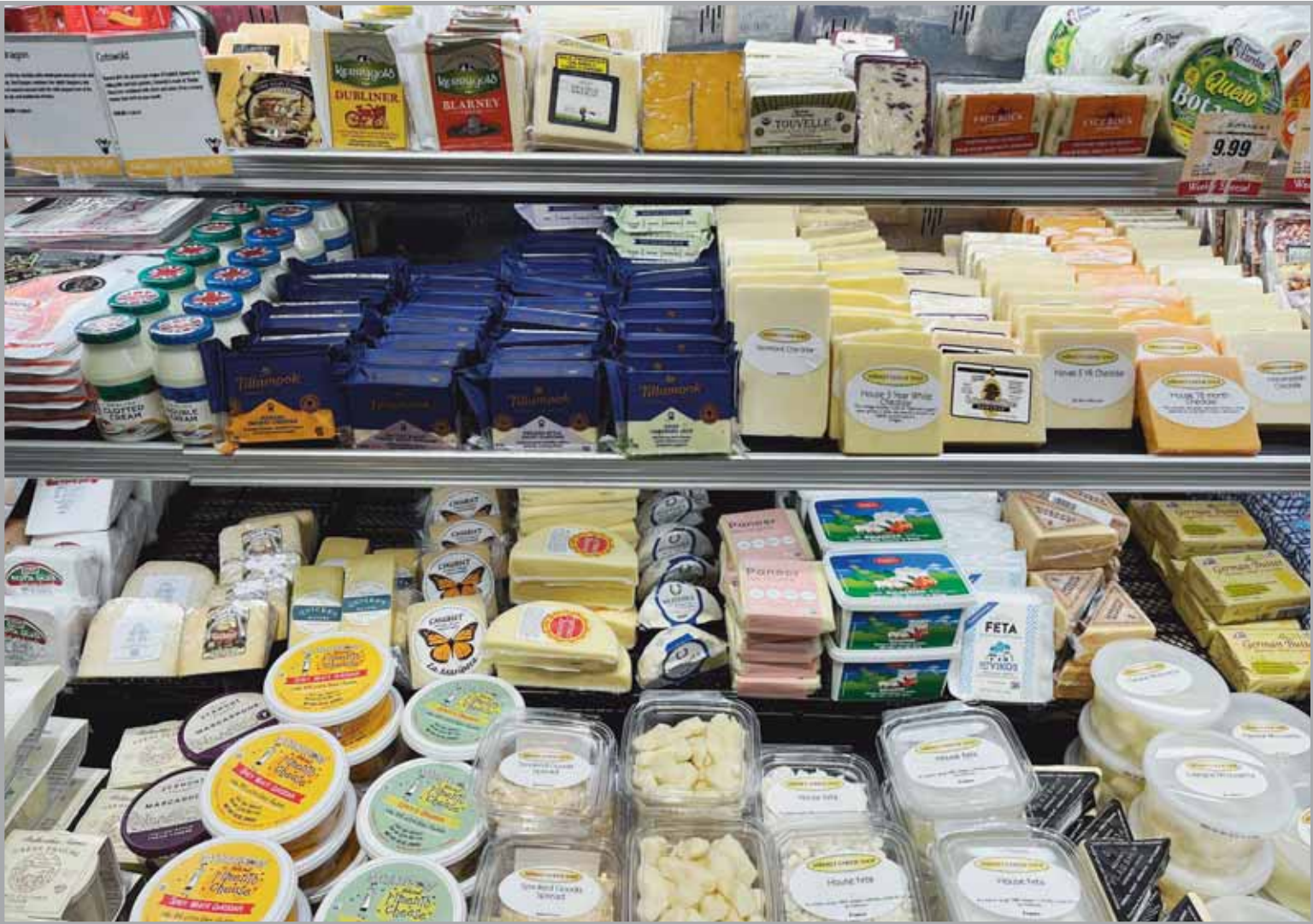
Market of Choice stocks a wide assortment of cheeses perfect for a picnic cheeseboard.

You’d hate to find yourself without a beverage during a wam and sunny picnic, and Market of Choice has you covered in that regard as well. From an assortment of wines to locally-crafted hard ciders, pale ales and porters, and even non-alcoholic beers and cocktails, Market of Choice’s beer and wine department has plenty of options. The cold case in the beer department stocks dozens of locally-made thirst-quenching sours like the peach sour from Oregon City’s Bent Shovel Brewing, a prickly pear sour from Hopworks Urban Brewery, a passionfruit sour ale from little Little Beast Brewing, Jerry Cherry Berry from Montavilla Brew Works and plenty more.