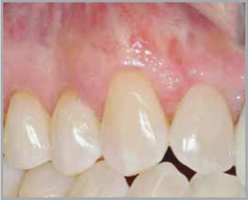
After a gum graft surgery, the same patient no longer shows exposed tooth root.