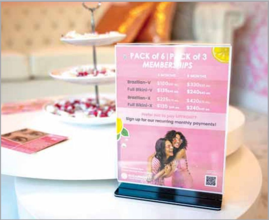
Sugaring NYC offers a number of specials.