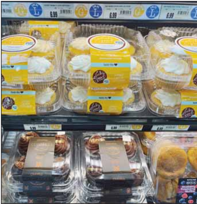
6 MARKET OF CHOICE Purchase all your picnic essentials here