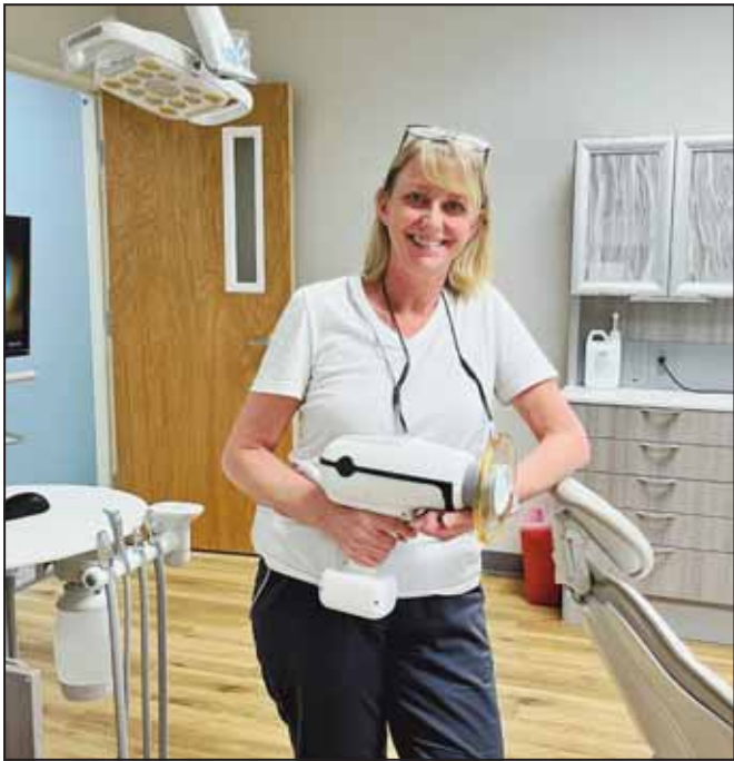
5 ADVANCED DENTAL ARTS CENTER Prevent gum recession at local office