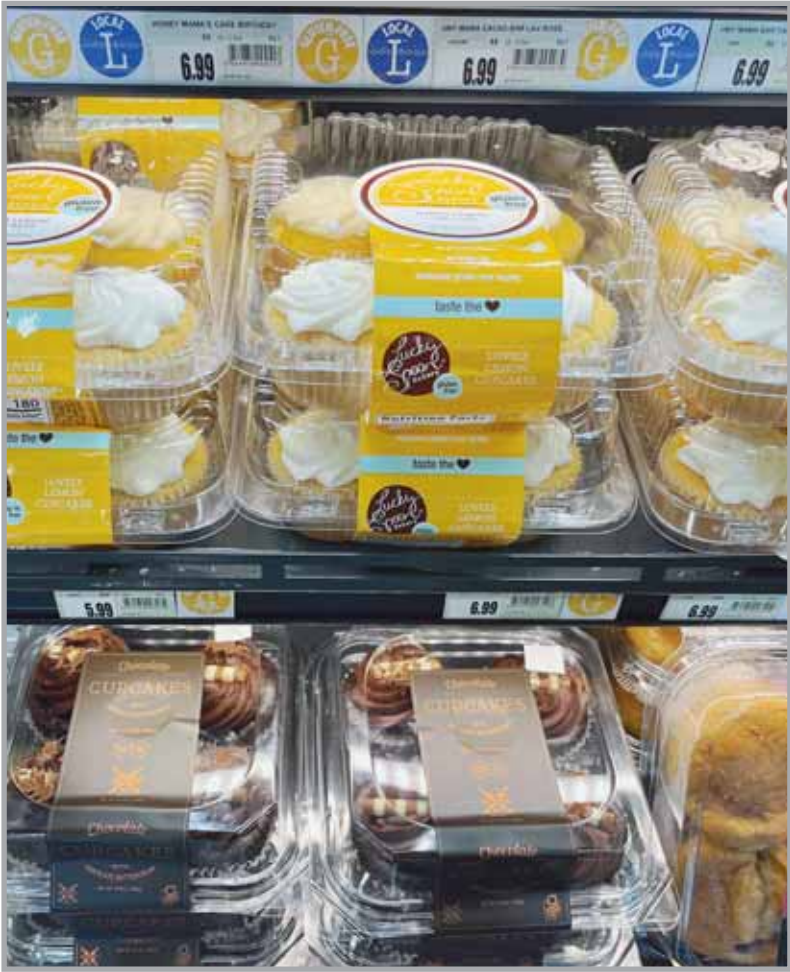
Market of Choice has a dizzying assortment of baked goods including a variety of gluten free treats like lovely lemon cupcakes.