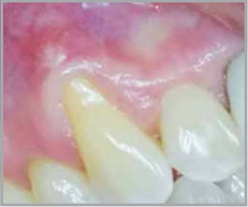
This before photo of an Advance Dental Arts patient's gum shows the exposed root of a tooth.