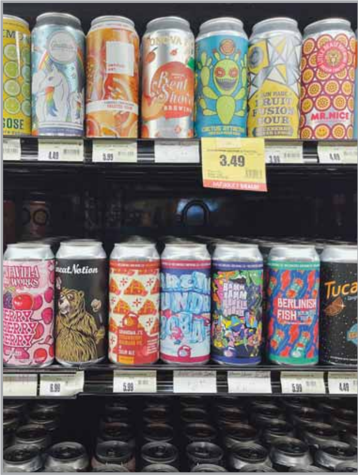
The cold case in Market of Choice's beer department stocks dozens of locally-made thirst-quenching sours.