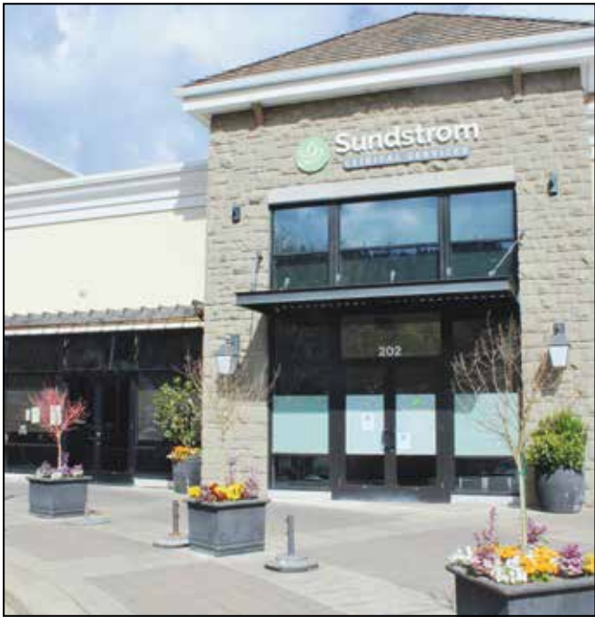
5 SUNDSTROM CLINICAL SERVICES Clinic can help improve parent-child relationships