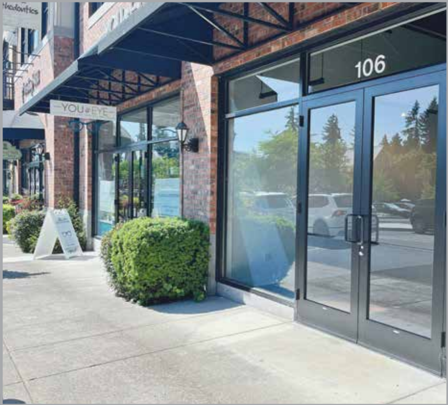
Acquiring the next-door space allows You & Eye to nearly double its footprint.