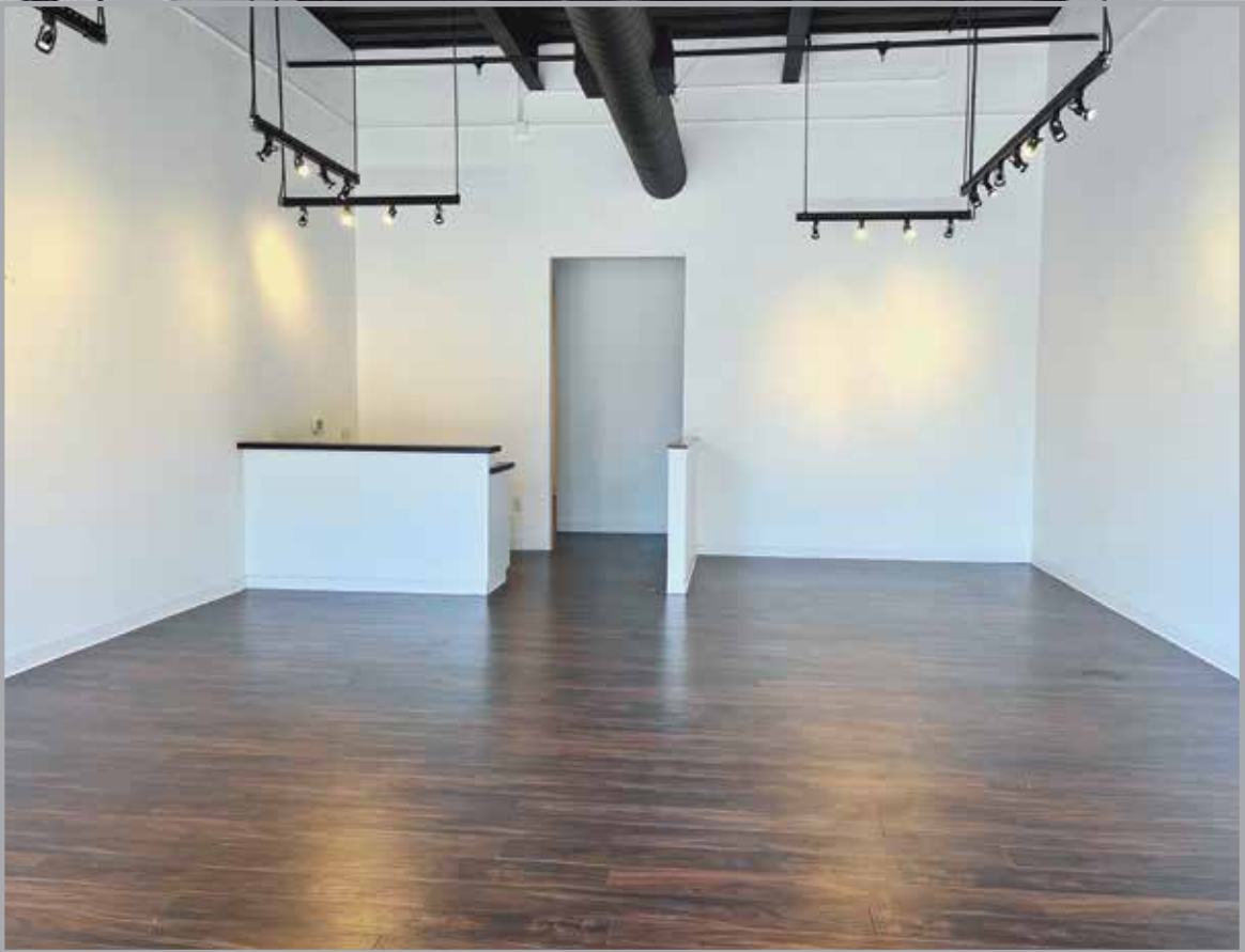
You & Eye will take over the next-door space formerly occupied by Lovell & Hall Real Estate Partners.