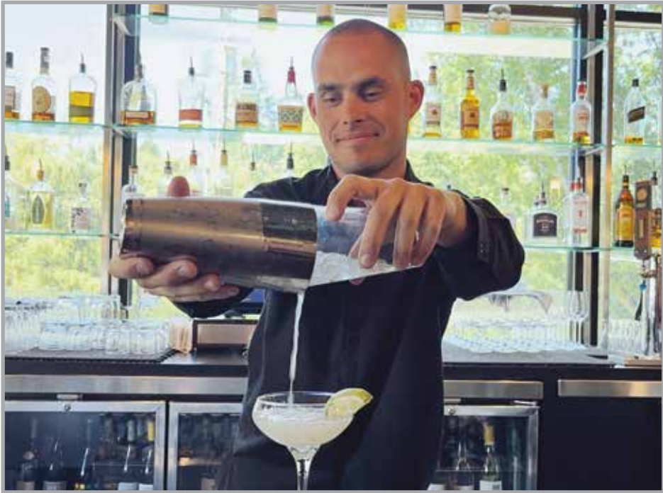
Known for its food and cocktails, Five-0-Three plans to offer several frozen cocktails this summer.

The menu will feature barbecue favorites like braised beef, pork ribs, smoked chicken, baked beans, potato salad and coleslaw.