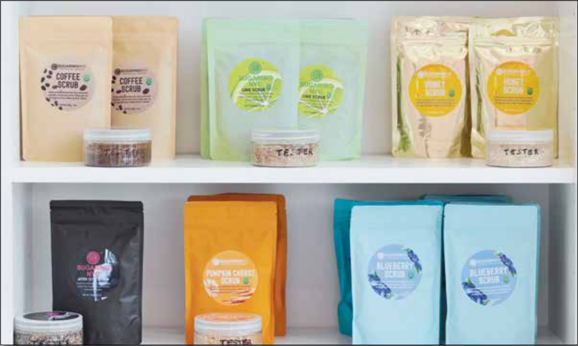
Sugaring NYC sells scrubs that help make your skin look even better.