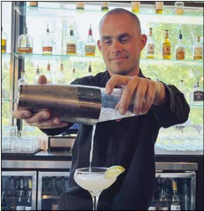
6 FIVE-O-THREE Enjoy special menus at the restaurant