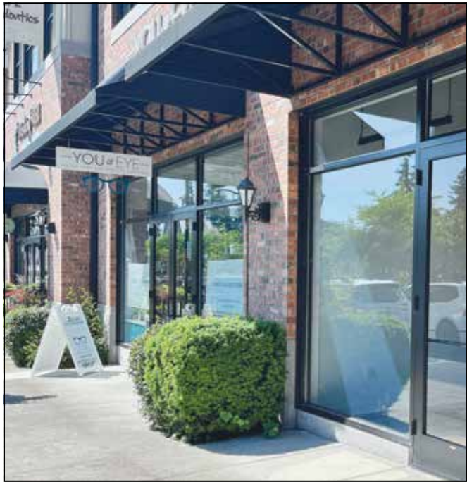
4 YOU & EYE Optometry and eyewear shop expands

A SPECIAL PUBLICATION OF PAMPLIN MEDIA GROUP/COMMUNITY NEWSPAPERS